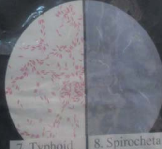
7. Typhoid Bacteria