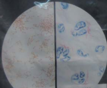
5. Diphtheria Bacteria