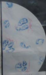
6. Bacilli Tuberculosis