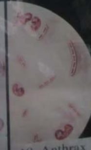
10. Anthrax Bacilli