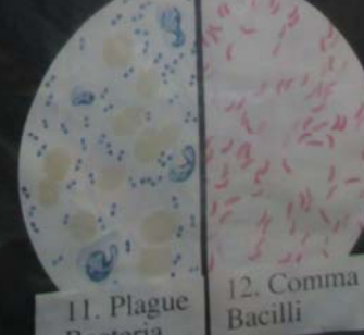
11. Plague Bacteria