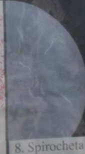
8. Spirocheta Pallida