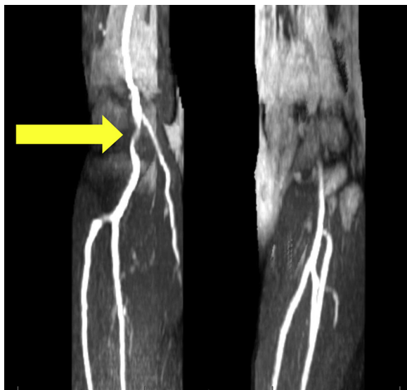
Fig 1. Magnetic resonance imaging (MRI) with time of flight imaging showing 70% focal stenosis of right popliteal artery (arrow).

was prescribed 81 mg aspirin daily and was discharged home on postoperative day 3. At her follow-up visit, she had a normal gait and palpable pedal pulses, and her foot was warm and well perfused. The ankle-branchial index was 0.9 on the right and 1.06 on the left, and duplex ultrasound confirmed a patent right popliteal artery. Perhaps most important, several months later she gave birth to a healthy baby boy. After her pregnancy, magnetic resonance angiography with contrast enhancement was performed and was negative for contralateral popliteal entrapment.