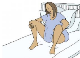
SITTING UP IN BED