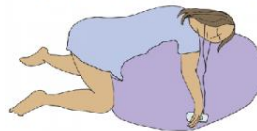
LAYING DOWN ON THE BALL