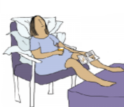
Sitting in chair