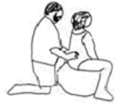
SWAYING ON BIRTHING BALL