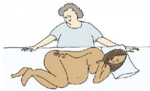
LAYING DOWN SIDWAYS