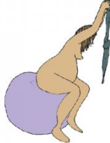
BALANCING ON THE BALL