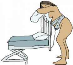
LEANING AGAINST THE BED