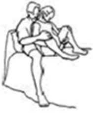
SEMI RECUMBENT (45 DEGREES)